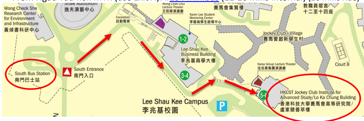
Map of the route from South Entrance to Conference Venue