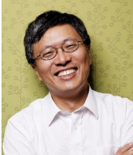
Harry Shum, Ph.D.

University Council Chairman, The Hong Kong University of Science and Technology (HKUST) Foreign Member, National Academy of Engineering, U.S.A.