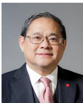
Victor K. Fung