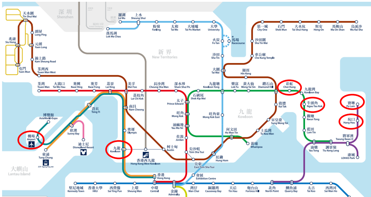
MTR Route Map