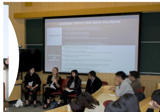
Ideas Polygram, Fung Scholars Leadership Conference 2019, Shanghai

This is a great opportunity to network with individuals who share similar interests, explore potential partnership opportunities, and gain fresh insights from fellow attendees. Participants will join sub-group sessions where you are invited to give a brief 2-minute presentation . It's crucial to actively listen to others and engage in constructive dialogue with your peers. Through this, you can build meaningful connections and potentially find new partners for future projects or collaborations.