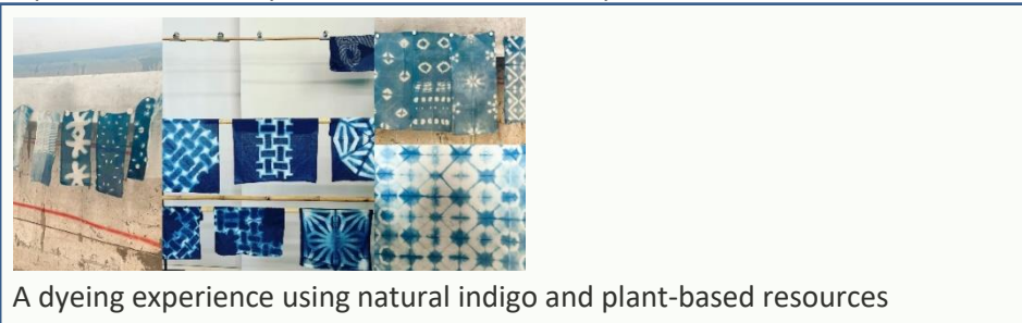
A dyeing experience using natural indigo and plant-based resources