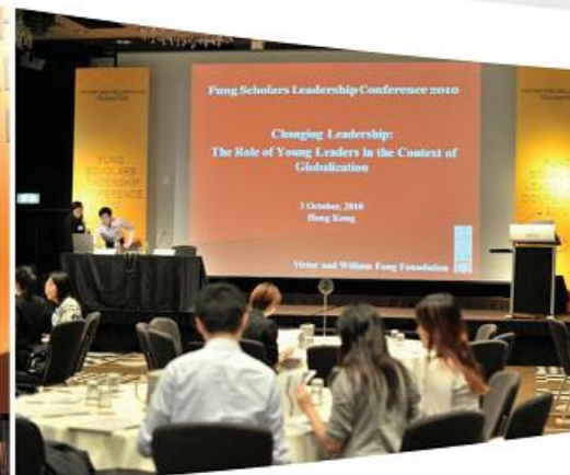
The conference is about to begin.

Apart from the formal setting of the Conference, the Foundation also organized Pre-Conference and Post-Conference activities: