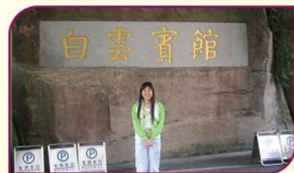
My working places