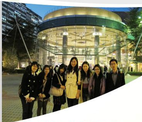
Group photos at the entrance of the Forum venue.