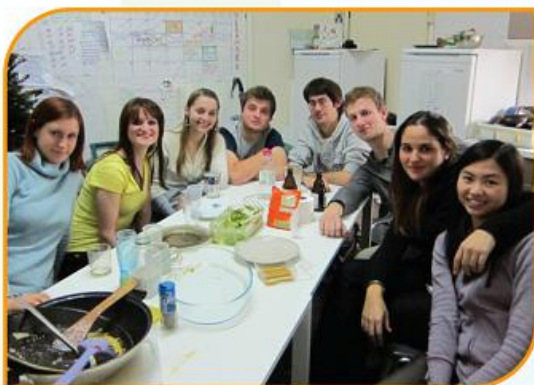
My friends in Antwerp

Last semester, I studied at the University of Antwerp, Belgium as an exchange student. This is the most remarkable experience in my life. I have met so many lovely friends from different countries. What's more exciting is that I could have a chance to travel around Europe. I can't forget