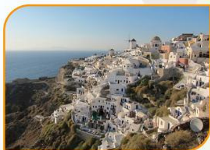
Greece - Santorini

the moment when I stepped in the concentration camp in Germany, the moment when I joined the mass held in St. Peter's Church in Vatican City, the moment when I climbed up Jungfrau..... All these allowed me to look into different countries deeply. I can't imagine how beautiful the world is!