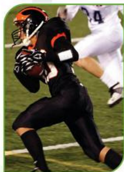
Sprint Football at Princeton