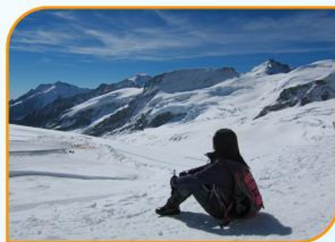
Swiss - Jungfrau