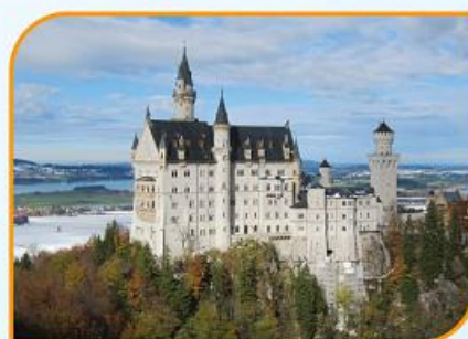
Germany - Schloss Neuschwanstein