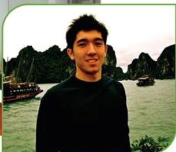
Traveling in Vietnam on my year off