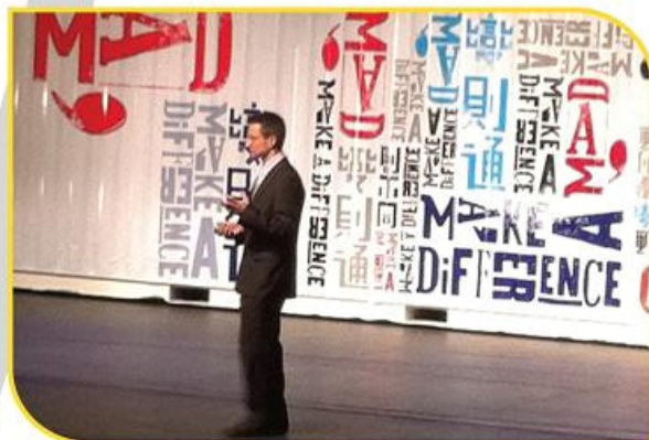
Prof. Tal BEN-SHAHAR talking on "Positive Psychology: Making a Difference" in MaD Forum 2011 Closing.

I realized that three days were gone faster than I expected when watching small red balls become big ones at the end of the forum closing. And I believe there is already a seed growing in my heart. Although the forum may not be as motivating as I expected before, I really appreciate that it inspired me to freely choose a totally new life style in the future, provided that I do wish to make a difference. I believe it is an unforgettable experience in my life.