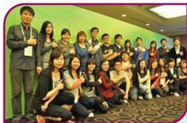
The first day that all Hong Kong volunteers gathered in BaiYun Hotel.

The most impressive part of my job was organizing a birthday party for those who had their birthday during the Guangzhou Asian Game. The birthday party was really a warm and meaningful event. Activities included lucky draw, games and performance. Every November-birth volunteer was presented a birthday gift.