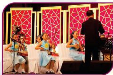
During the birthday party

In my last working day, I had my last lunch with my teammates and our leaders in BaiYun Hotel. They gave me a box of goat toys which symbolize the city, Guangzhou. It was really an unforgettable and touching experience to me.