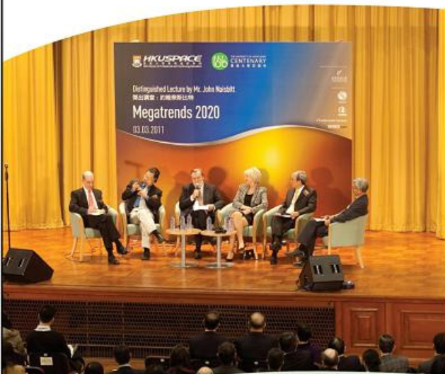
The lecture at HKU was attended by 3,000 participants.