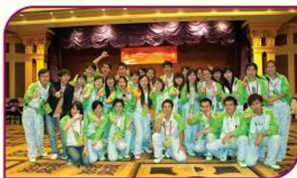
The show finished successfully