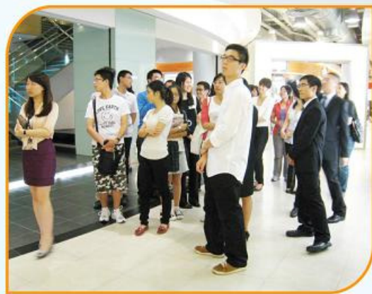
Fung Scholars touring around the showrooms of the Li & Fung Group.