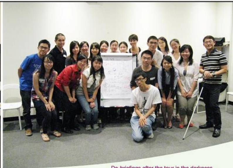
De-briefings after the tour in the darkness.