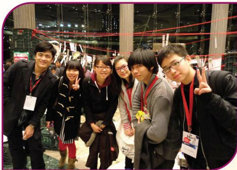
The “Exchange Square” for participants to exchange what they need.

After the forum, I have become more enthusiastic about making a difference, either within my own self or to the people and community around me. I have learnt to strive for my dreams- where I hope for my future success.