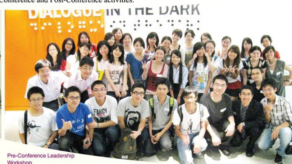
Pre-Conference Leadership Workshop

The Fung Scholars Leadership Conference 2010 was held on 3 October 2010 at the Ballroom of Sheraton Hotel (Hong Kong) with the theme “Changing Leadership: The Role of Young Leaders in the Context of Globalization”.