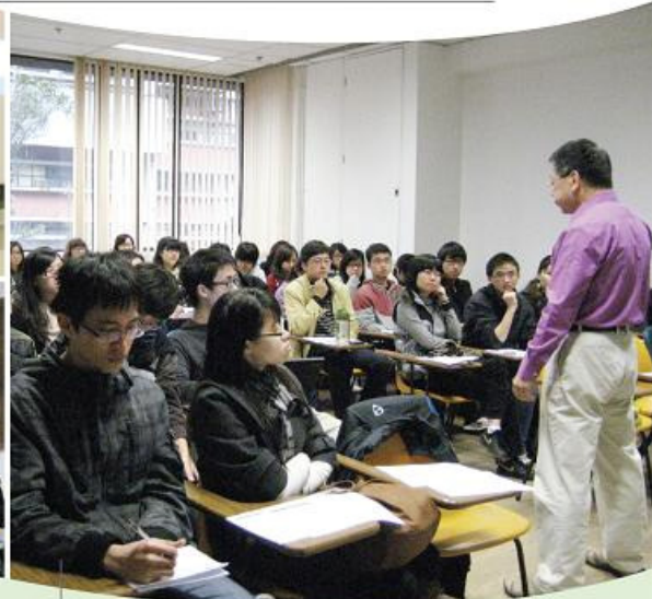
The pre-lecture talks were attended by 50 Fung Scholars.