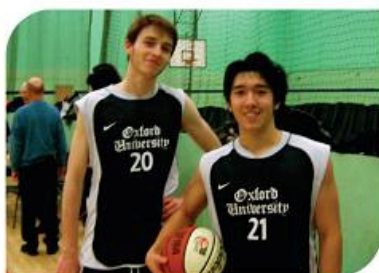
Basketball at Oxford

During the spring of 2009, while I was studying abroad at Oxford University, I was selected as a Fung Scholar. The scholarship has had a very meaningful impact on my life. Through the scholarship I was given the opportunity to intern at EJ McKay, an investment bank in Shanghai. The experience helped me realize my career plans - specifically I found I had a passion for finance with a focus on Asia. Following the internship I decided to take a year off and gain more work experience. I had multiple internships throughout the year in both Hong Kong and New York where I was able to gain a broad perspective on the industry. Besides career development, being chosen as a Fung Scholar has additionally helped me realize how fortunate I am to have been afforded such wonderful opportunities. Similar to Victor and William Fung, I hope to give back to society what has been so graciously provided for me.