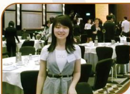
Attending the Leadership Conference 2010 in HK