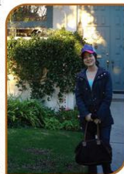
In the USA

I even didn't realize a big smile came to my face when I was sitting in the UCLA campus recalling the great time I had with the Fung Scholars family. Currently being lucky enough to participate in an exchange program in UCLA, I am enjoying my life here both as a student and an explorer as what is deemed as the essence of exchange by the Fung Scholars Program, which encourages all kinds of exchange opportunity that involves as many areas and students as possible. Knowing that the next Leadership Conference will be held in the United States, we as Fung Scholars are all excited about this coming opportunity for the whole family to gather together again, thinking and discussing leadership in the East and West as well as sharing our different but wonderful stories in the past year.