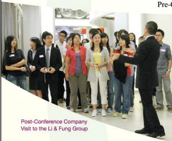
Post-Conference Company Visit to the Li & Fung Group

Apart from the formal setting of the Conference, the Foundation also organized Pre-Conference and Post-Conference activities: