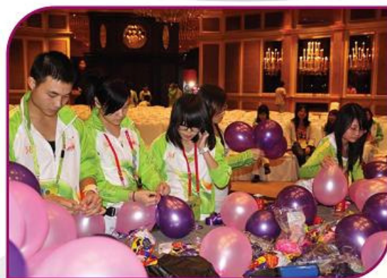
Preparing for the party